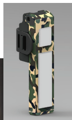
Available for Veterans in Camo pattern